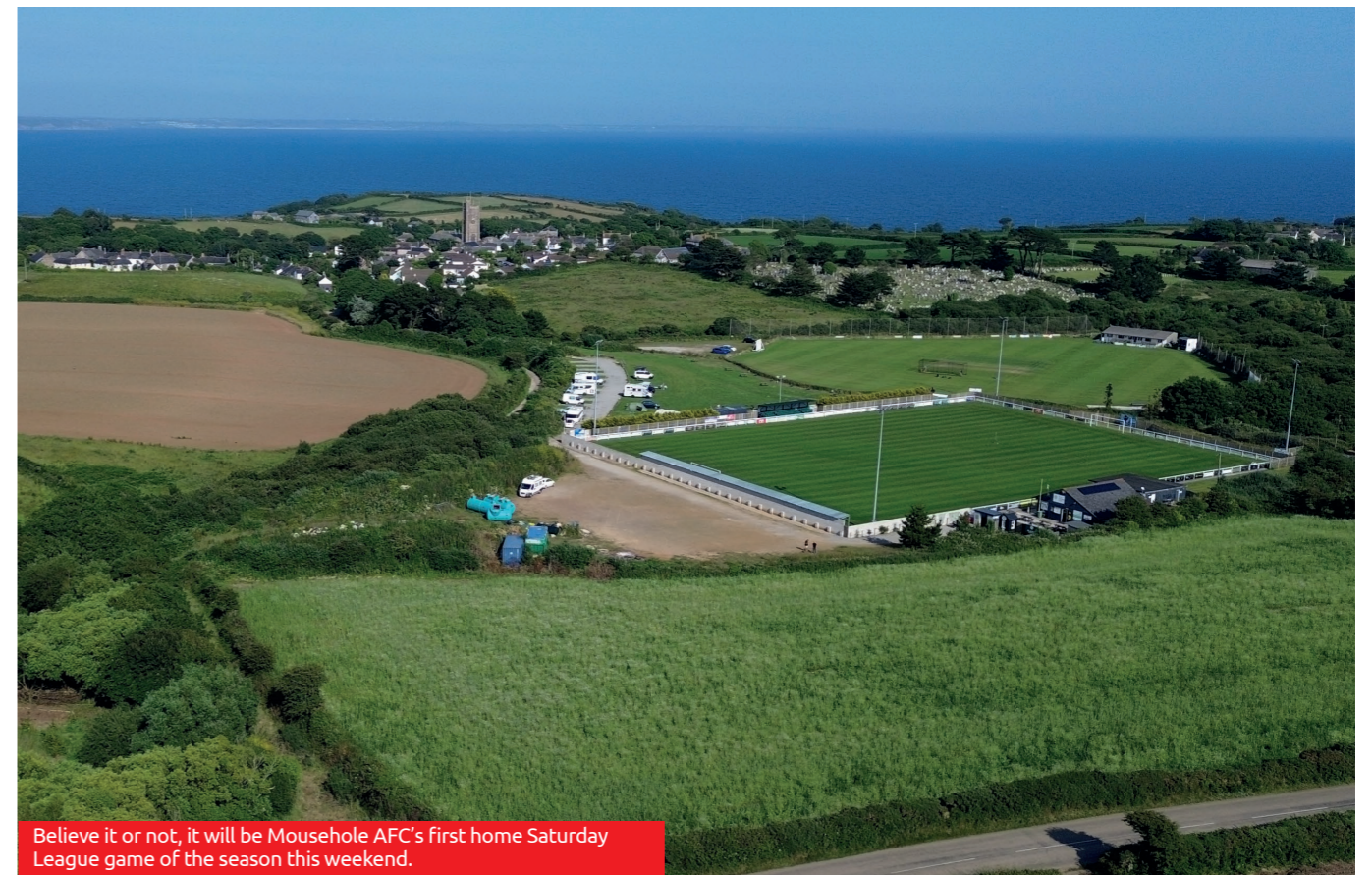
Believe it or not, it will be Mousehole AFC's first home Saturday League game of the season this weekend.

Bashley return to home action as they take on a Hartpury outfit who will be looking to respond in the right way to their late defeat on their long midweek trip down to Falmouth Town in their last outing.