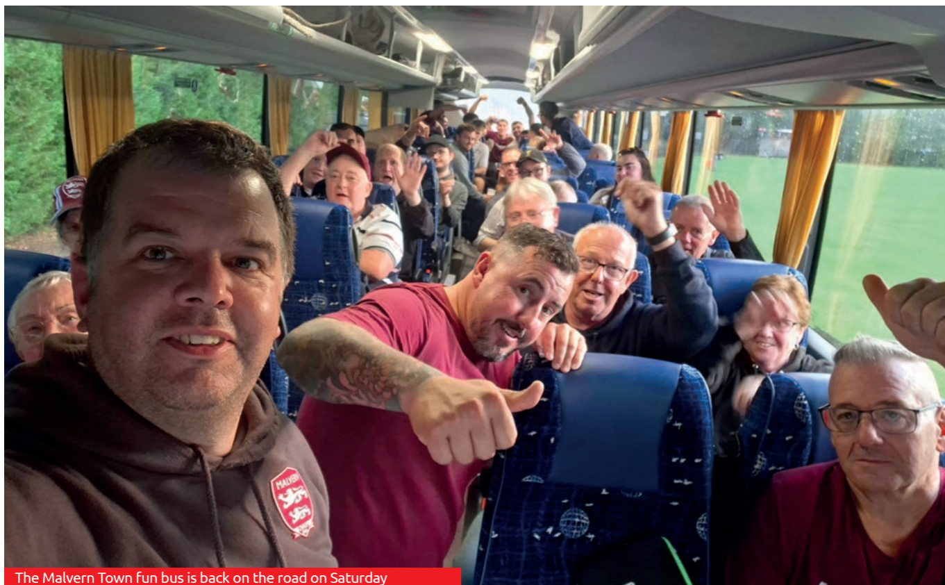
The Malvern Town fun bus is back on the road on Saturday

"It's been a great start to the season; top of the League at the minute, so you can't ask for any more than that!