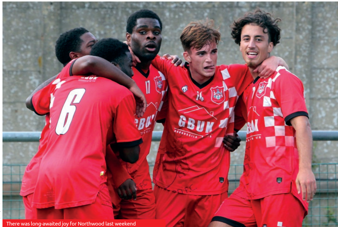
There was long-awaited joy for Northwood last weekend