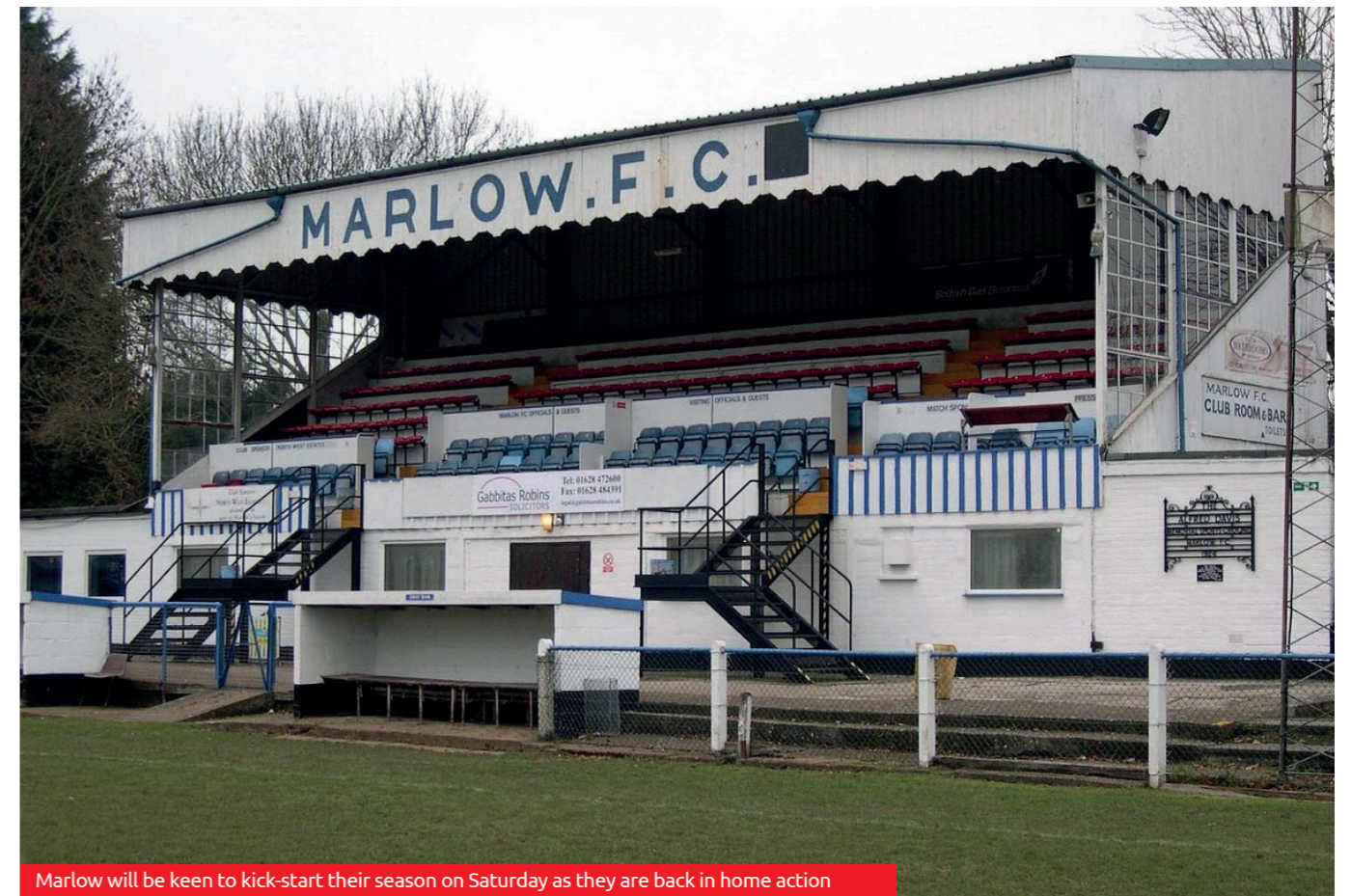
Marlow will be keen to kick-start their season on Saturday as they are back in home action

Leaders, Biggleswade FC, take to the field on Friday evening as they welcome a Barton Rovers outfit who arrive in fourth place and, like their hosts, unbeaten in the League so far. A mouth-watering contest is in prospect here.